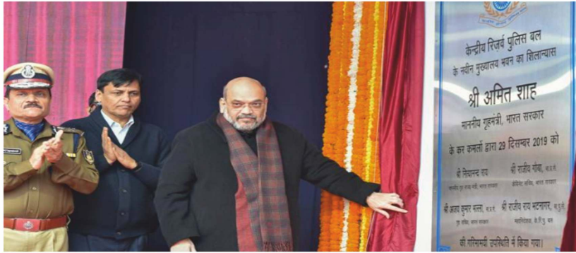
Union Home Minister Amit Shah during the foundation laying ceremony of Directorate General building of CRPF in New Delhi